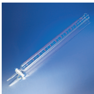
PYREX® Burets caption needed

Wash the stopcock or rubber tip separately. Before a glass stopcock is placed in the buret, lubricate the joint with stopcock lubricant. Use only a small amount of lubricant. Burets should always be covered when not in use.